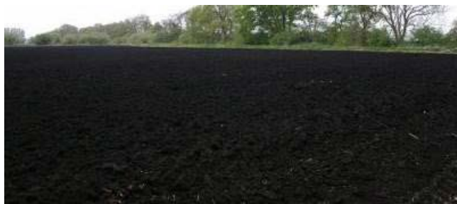
Figure 1. Land prepared by using Rotavator.

Phosphate and nitrate pollution has been reported as one of the main problem in agriculture and terrestrial ecosystems, especially under intensive use of chemical fertilizers containing phosphorous and nitrogen 6 . Leaching of Phosphate and nitrate is the most prevalent groundwater pollutant and it also represents a serious health problem. Several researchers and scientists have studied mineral levels in different bodies of water sources, and have concluded that, the levels of nitrates and phosphates have major impact on the overall purity of the water 7 . A recent Greenpeace Research Laboratories investigation on the effects of synthetic nitrogen fertiliser on groundwater pollution in intensive agriculture areas in three districts of Punjab shows that 20 per cent of all sampled wells have nitrate levels above the safety limit of 50 mg of - nitrate per litre (50mg/L NO 3 for drinking water established by the World Health Organisation (WHO) 8 . Under soil fertility management it has been suggested that combinational use of organic manures with fertilizers will not only sustain the agricultural soil health but also increases crop production rate effective in enhancing the nutrient use efficiency of agricultural soil 9 . The same is shown in Figure1.