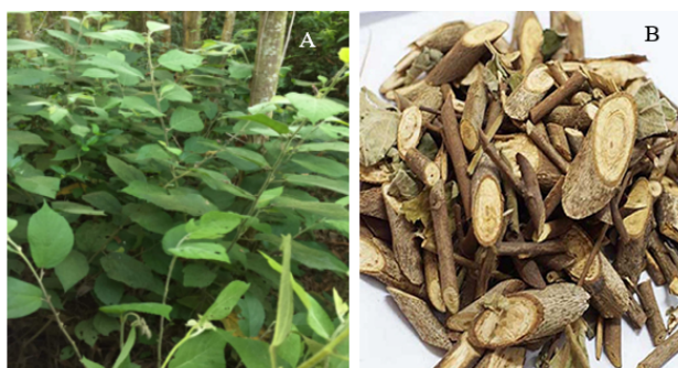
Fig 1. Materials of H. hirsuta . A. Leaves; B. Roots

H. hirsuta leaf and root samples were gathered at the Linh Mu Pagoda in Hue City's Kim Long Ward in Thua Thien Hue province. The roots and leaves are cleaned, dried in the shade, and pre-treated to get rid of pests and damaged roots and leaves. It is pulverized and put through a filter with a particle size of 1 mm before being dried at a temperature of 50°C until they are 10% moisture, then stored in a plastic box for use in subsequent studies (Figure 1).