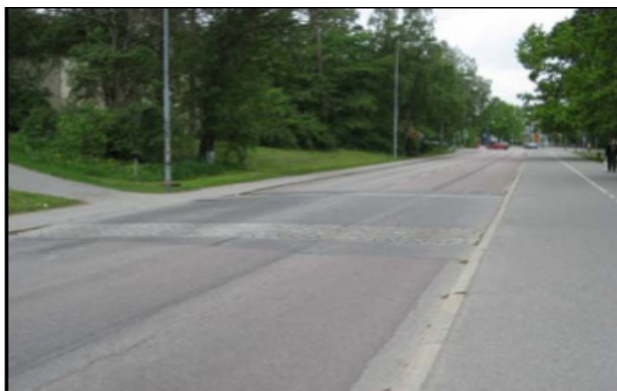
FIGURE 5. Road C.