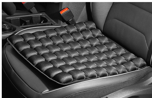
FIGURE 2. Seat with air-celled cushion.