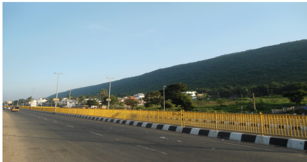
FIGURE 3. Road A.

The experiment with the subjects is conducted on three four different types of roads shown in the figure viz. highway, Belgian block paving, bumpy road and unpaved road shown named as roads A, B, C, and D are shown in Figures 3–6, respectively.