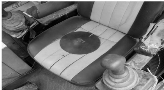
FIGURE 1. Seat with seat pad accelerometer.

For vibration measurement, a seat pad accelerometer of model SV 38 is placed on the seat surface and the accelerations were measured. Then the seat pad accelerometer is placed on the surface of the air cushion which is placed on the seat for measuring the same. To measure the floor acceleration tri-axial accelerometer of model Sv84 is used. Both the