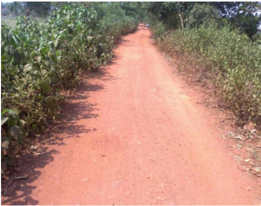
FIGURE 6. Road D.

On-road tests were performed to evaluate the ride comfort two tri-axial accelerometers were connected to the SV 106 vibration meter which is set to measure the r.m.s. acceleration in three Cartesian coordinate directions, namely X, Y, Z both on the floor of the car that is at a point on the chassis near to the seat base using tri-axial SV 84 accelerometer and then on the surface of the seat using SV 38 tri-axial seat pad accelerometer. First, the measurements were taken for the existing seat i.e. is without air cushion and the same was repeated with the seat on which the air cushion is placed. The experimentation was conducted with three different subjects of different weights ranging from 65 kgf to 85 kgf and on four different roads A, B, C, and D described in Table 1. Each subject has driven the car on all the four roads at different speeds ranging from 20 kmph to 80 kmph depending on the safe permissible speed limit of the road and feasibility of driving on the road. On Type A road, the test was conducted at four different speeds of the car mentioned in Table 1 which shows the feasible and permissible testing speeds on each road. Driving on the roads B, C, and D it is found to be very difficult over 40 kmph speed because unavoidable traffic and public interruptions, and moreover, the road has more bumps and moderately paved. All the subjects have driven the car by wearing safety seat belts.