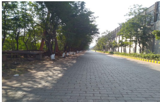
FIGURE 4. Road B.